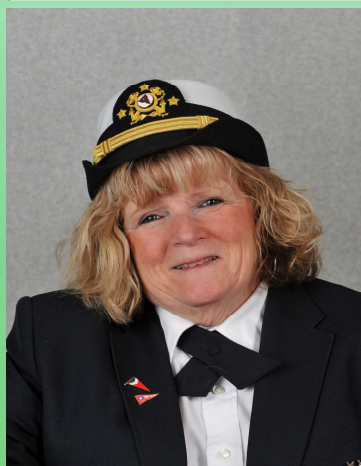
Commodore Colleen Cashman