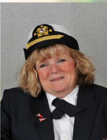
Commodore Colleen Cashman